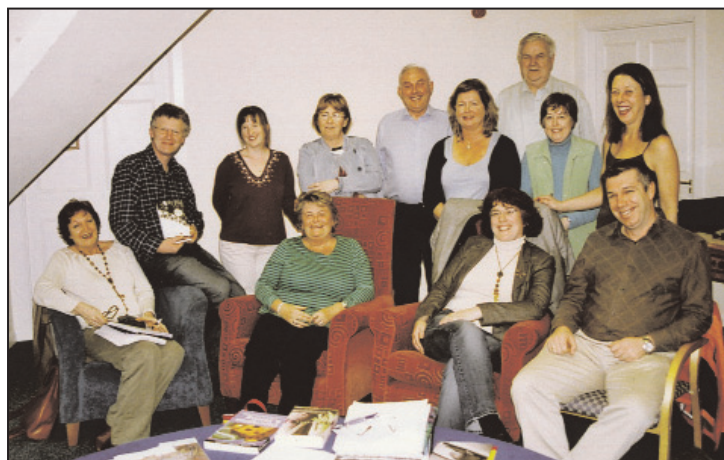
Ballea Writers get together, in the Ballea Suite of the Carrigaline Court Hotel, for a workshop on developing characters for Bealtaine stories.