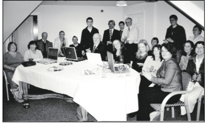
Ballea Writers Club Members, Sponsors and Supporters cluster around laptops to view the new website.